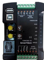
Lighting Tower Controller and Smart GEN 4G Modem

Introducing INNOV8 Cloud design using Smart GEN technology for remote programming. Download the simple to use app for iPhones and Androids and set up your lighting tower.